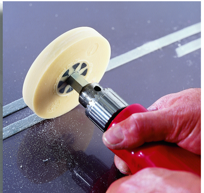
3M™ Stripe Off Wheel

Removing 3M™ VHB™ Tape residue with the 3M™ Stripe Off Wheel is faster and easier than solvents or adhesive cleaners. The wheel is also non-combustible to reduce fire danger. Resilient rounded edge follows contours and irregular surfaces. Residue comes off without scratches or damage to acrylic enamel or urethane paint.