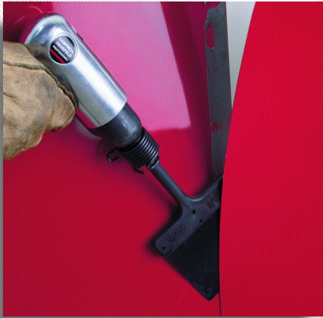
3M™ SMART Tool

Use the 3M™ SMART Tool by hand or in an air chisel and quickly separate such bonded assemblies as overlapped panels and stiffeners. With the tool's steel reinforced handle and flexible blade, you can separate large or small parts and minimize damage to the surfaces.